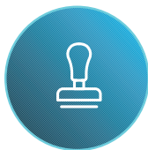
Annotation & Bates Stamping