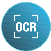
Optical Character Recognition

Higher Duty Cycles and Periodic Maintenance Intervals provide greater volume with fewer routine service calls so you can stay focused on productivity.